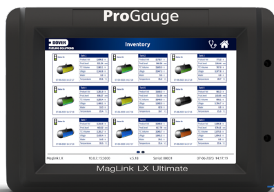
ProGauge MagLink LX Ultimate console

Whatever your needs and whatever your forecourt set up, MagLink LX Ultimate puts peak performance at your fingertips with next-level monitoring.